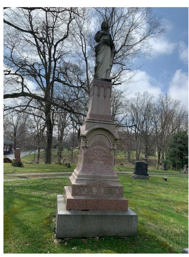
The Jonas Freer monument stands 16 feet tall and weighs 17,000 pounds

In 1898, $143 was spent to purchase official cemetery record books. The old wooden arch which initially covered the entrance was replaced in 1904 with Indiana limestone at a cost of $815. The limestone entryway is still in use today.