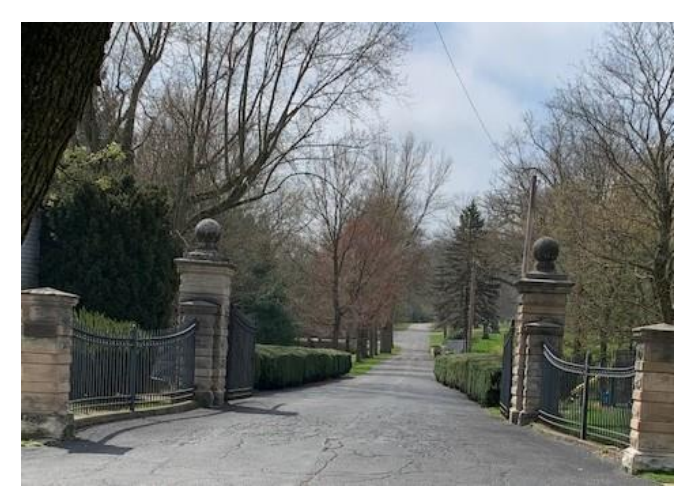
The current cemetery entrance was built in 1904 with Indiana limestone at a cost of $815

The Ashland Cemetery Association is still classified as a 501(c)(3) nonprofit organization, which is entirely self-funded through the money received from the sale of burial plots and continues to be financially sound. By law, the city of Ashland would have to take over if it cannot fund itself.